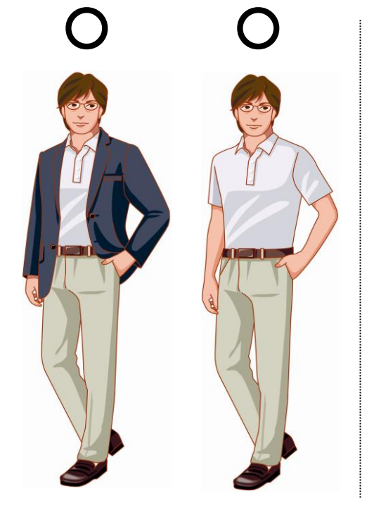
Jacket & Polo Shirt Chino pants or wearing no jackets is OK Dress shoes or casual shoes